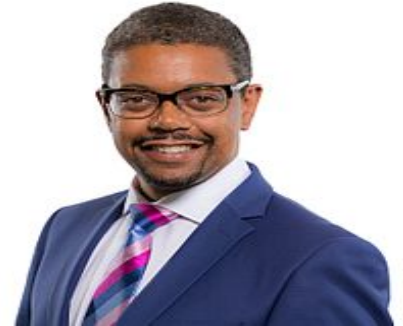
Vaughan Gething AM Cabinet Secretary for Health, Well-being and Sport

“The NHS Wales process has been improved following a review in 2013-14. A further review will now take place to ensure better consistency of decisions across Wales and make recommendations about what clinical criteria should be applied when determining eligibility”