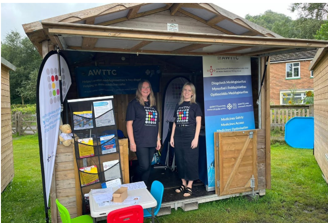
AWTTC at the National Eisteddfod