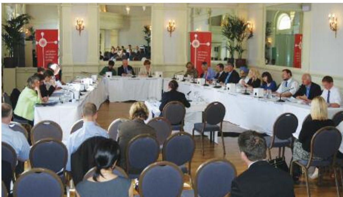
View from the public gallery at the September 2011 AWMSG meeting in Abergavenny – AWMSG brings together an expert panel of NHS clinicians, pharmacists, academics, health economists, industry representatives, patient advocates and lay representatives.

AWMSG holds up to ten meetings a year, at which recommendations on the use of new medicines are agreed, prescribing advice is considered for endorsement and developments in prescribing practice are discussed and reported. These meetings are held in public and all relevant information is available on the AWMSG website: www.awmsg.org . The members of AWMSG during 2011-2012 are listed on page 12.